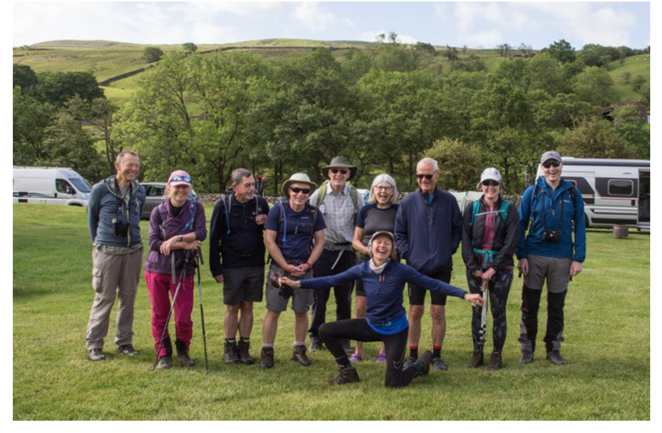
The happy team ready for the off on Saturday at the Swaledale meet. Read all about it on page 8.